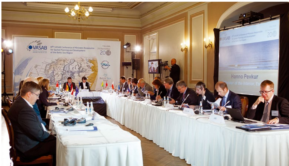
Opening of the Ministerial Conference