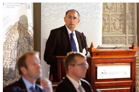
Mr Talis Linkaits (VASAB Secretariat)