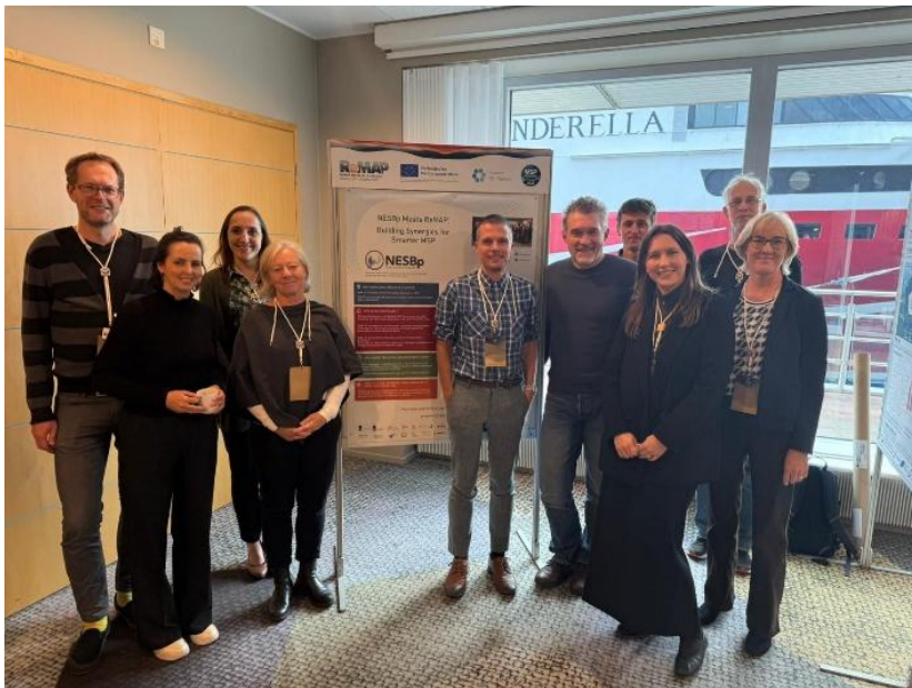
NESBp at the ReMAP project's final conference in Helsinki. October 2025

Wishing you all a successful and productive 2026 ahead!