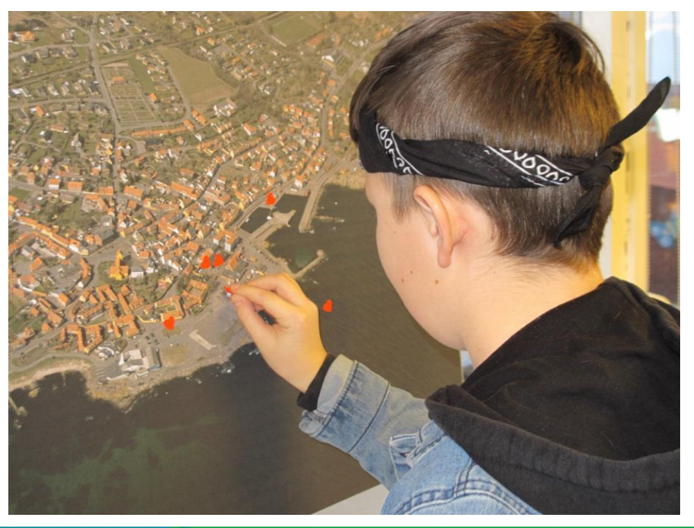
INVOLVING THE LOCAL PEOPLE IN THE MASTERPLAN FOR PEOPLE'S DEMOCRATIC FESTIVAL AND ALLINGE