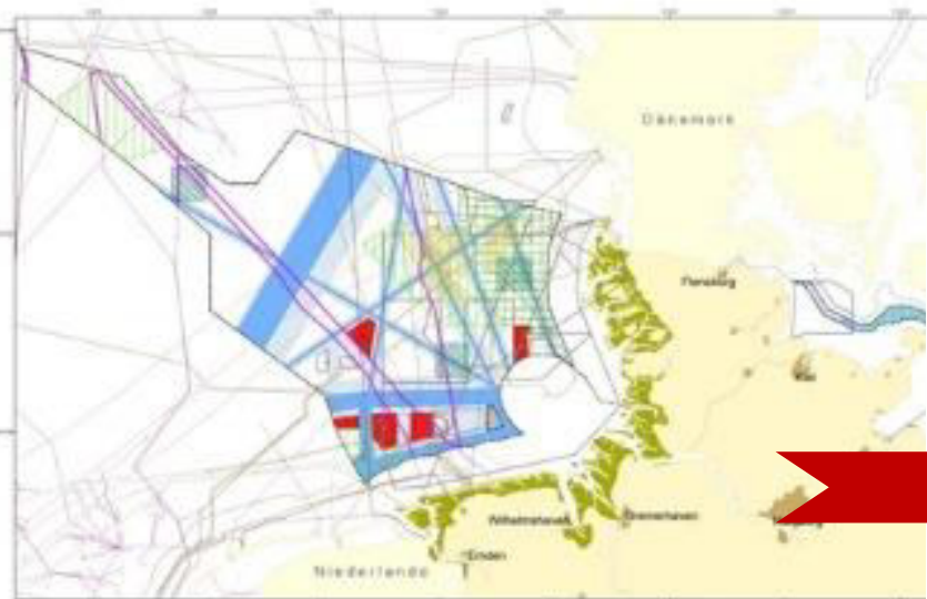
Raumordnungsplan für die deutsche ausschließliche Wirtschaftszone der Nordsee (21.09.2009) und der Ostsee