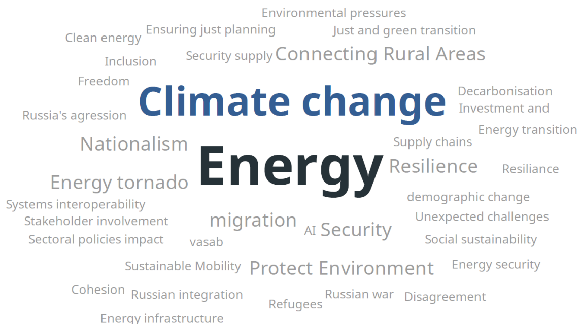
Fig. 2 Slido results: What do you see as the most pressing challenge?

Hauke Siemen then asked the audience via Slido to indicate where they see the most pressing for the future spatial development of the Baltic Sea Region, with following result: