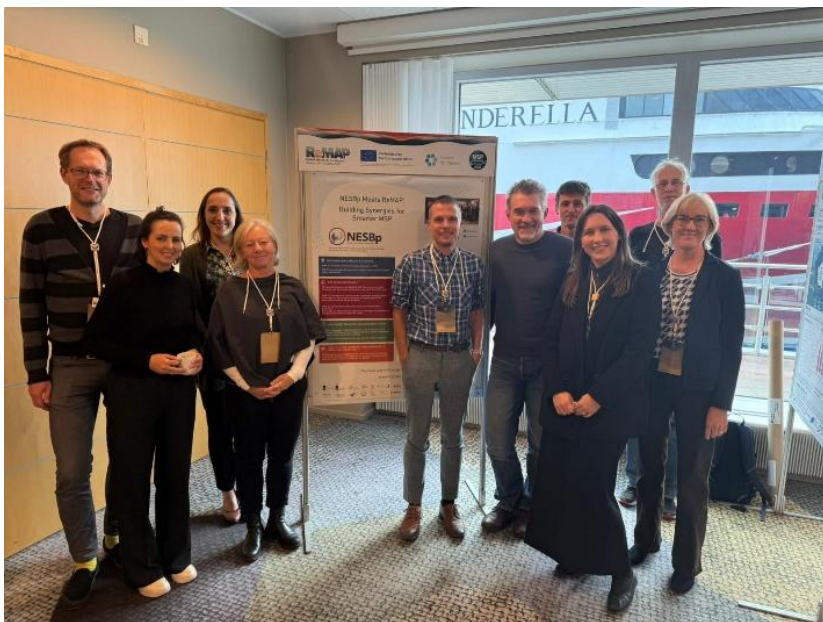
NESBp at the ReMAP project's final conference in Helsinki. October 2025

Wishing you all a successful and productive 2026 ahead!