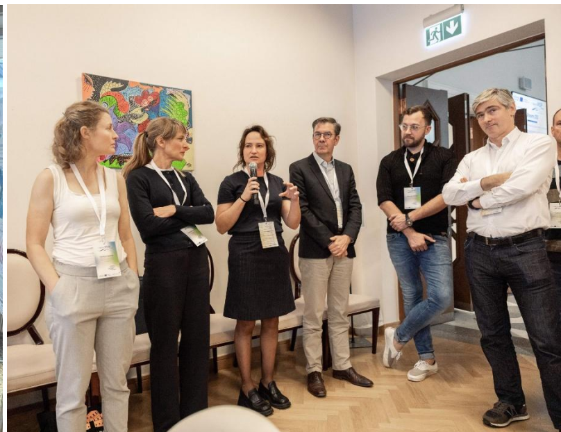
NESBp at the 5th Baltic MSP Forum in Riga. November 2025